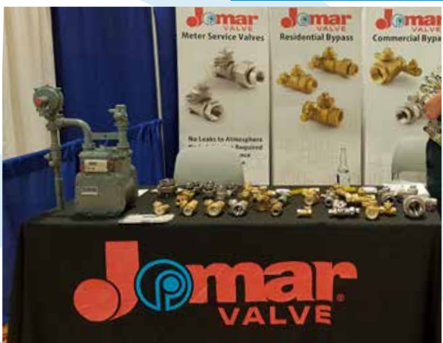
Jomar booth at SGA Expo in San Antonio, July 15-17 2019

Jomar shines at Southern Gas Association Expo in San Antonio, Texas Hci protagonist at ASHE Show in Baltimore, Maryland