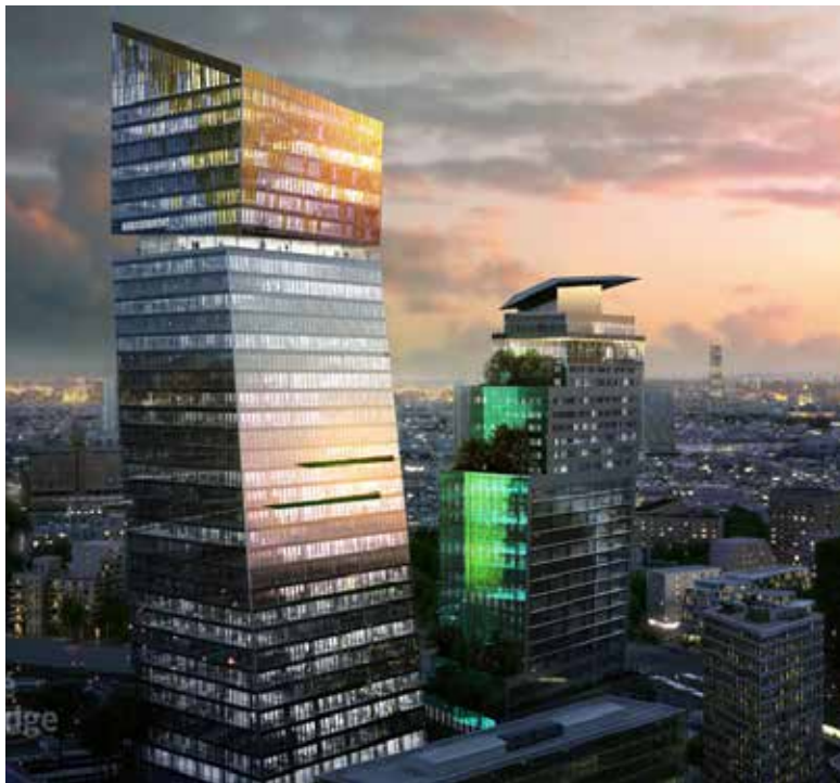
Render picture of the Duo-Paris complex

Duo-Paris: Pettinaroli specified to feature the green and futuristic French complex