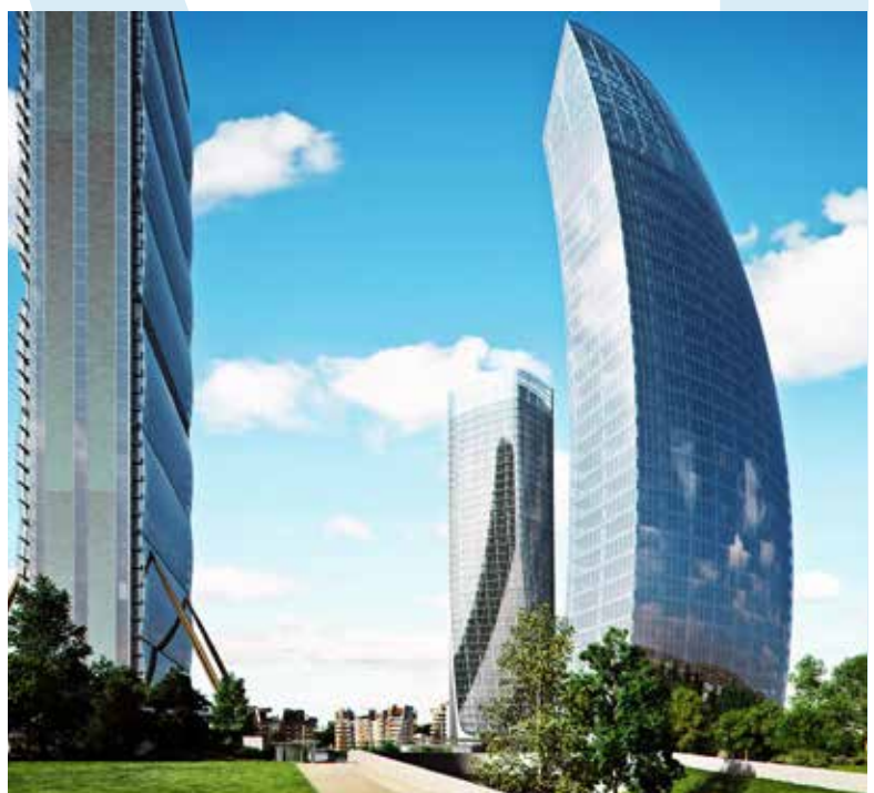
Render of Libeskind Tower at Milan City Life

S trengthened by the recognized quality of its products, Pettinaroli is once again confirmed as a leading supplier within the main projects of the renewing Milan city. After being included in the design specifications for the Hadid Tower at the beginning of 2016, now Pettinaroli products are also in the third skyscraper of the new City Life district in, the so-called “ The Curved One ”. The tower designed by the Polish-American architect Daniel Libeskind , is characterized by a rounded shape and reaches a height of 175 meters, housing offices with a capacity of over 3.000 people. Since the end of 2018, Pettinaroli has supplied 1.470 pieces of Rotary EvoPICV (81 and 83) and 92 pieces of 91L ½ “ .