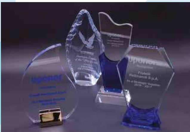
Uponor Award 2018/2019 (on the left) among the previous recognitions