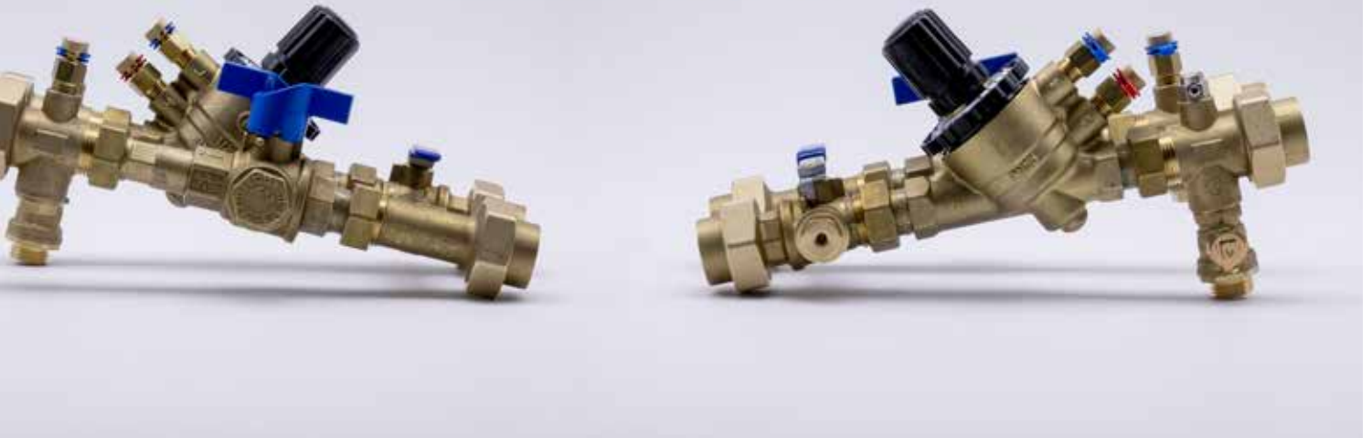
The new XT700 of preassembled kit