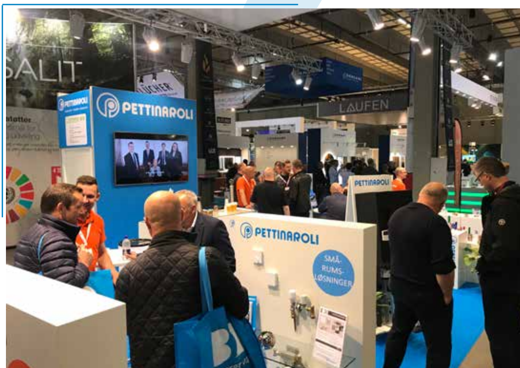
Over 9,000 confirmed presences attended the fair during 2019 edition

Three successful days for one of the most important trade fair in Scandinavia. Pettinaroli A/S was among the protagonists