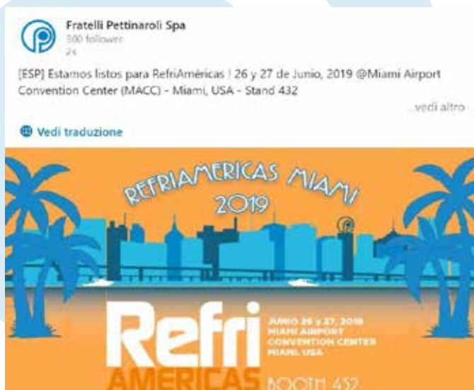
LinkedIn post advertising RefriAméricas 2019

publication of new technical/commercial documentation support and catalogues. The YouTube channel , was recently restyled and a reorganized aiming at making the contents more user-friendly and improving its indexing. This development will make Pettinaroli YouTube channel a significant hub for spreading technical and useful information as well as sharing news and conveying corporate identity .