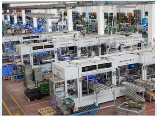
The three Ball Valves assembling lines

The conversion to a fully automated process of the three ball valves assembly lines has reached its final stage . The new machines will be capable of an annual production of over 800.000 pieces whose tightness and tightening can be verified directly by an integrated sensor system . The marking can also take place directly on the line by thermal transfer with lower environmental impact and the space needed to the pre-assembled material will be zeroed with consequent increase in the usable area of the department and of the warehouse.