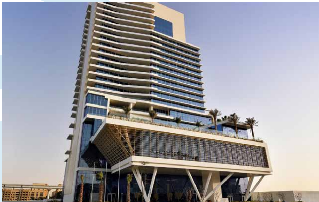
Front view of Grand Plaza Mövenpick Media City Hotel in Dubai.

M ore than 500 PCS kits are installed at the Grand Plaza Mövenpick Media City . The structure, which includes 24 floors, hosting 235 rooms and 6 restaurants, is located in Dubai , and was inaugurated on February 28, 2019. Pettinaroli supplied connection kits to the Fan Coil