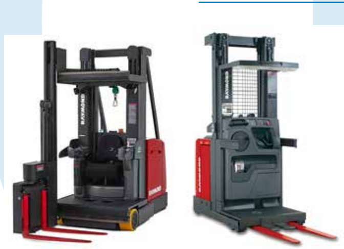
The new forklift models capable of working in a VNA warehouse

The 40.000 Ft 2 warehouse space has been reconfigured by narrowing the aisle and thus increasing the storage space by over 35% . This resulted in over 1.000 additional pallet locations allowing products to be stored in multiple ways and more efficiently, by giving them a location based on size. Of course this new warehouse layout significantly reduced the maneuvering space, from over 3m to 1.83m . That's why forklifts have been replaced with models conceived to allow Man-up picking so no more maneuvering space is now required.