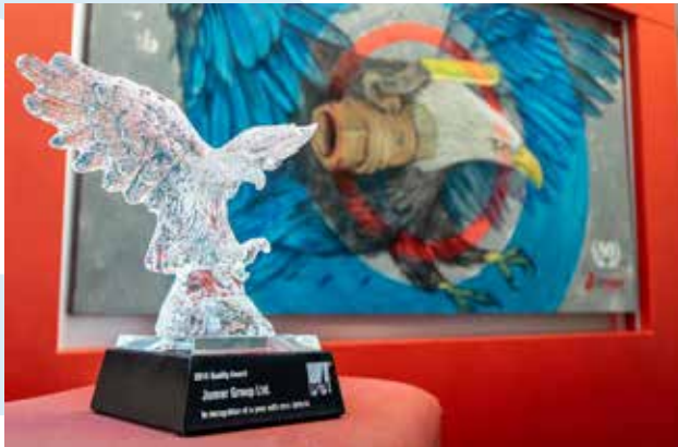
The Eagle Zero Defect Award

Pacific Gas & Electric awards Pettinaroli/Jomar with its most prestigious recognition