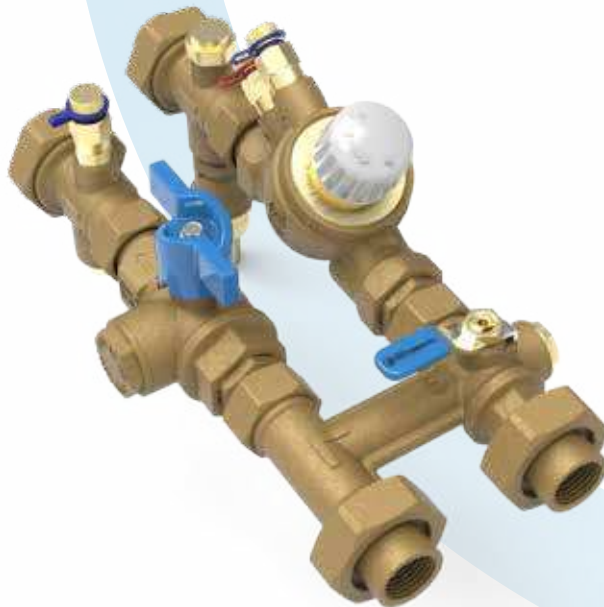
The XT704 preassembled kit