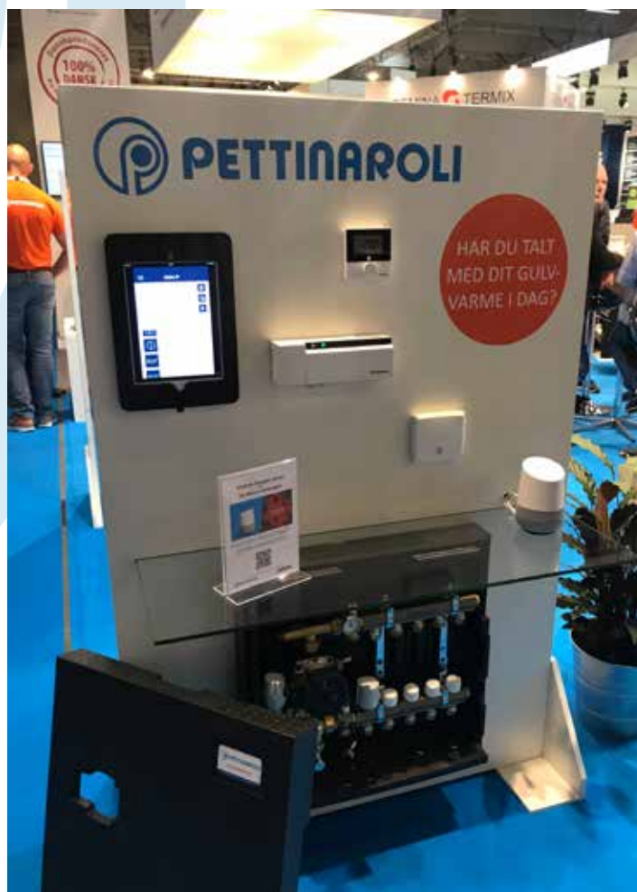
IP Comfort System at booth in Odense

The new lower module for quick and easy installation of manifolds for underfloor heating, connection pipes for radiators and sanitary water, coming with a completely insulated supply tube (according to DS452), which guarantees minimum heat loss. The new ball valve, 51KE and 701CWB water meter connection with surface TEA ® B - "White Bronze" extremely resistant to corrosion and without nickel, lead or cobalt, therefore ecological for the environment and drinking water. The CC50 manifold with 2 or 3 ways for water distribution and last but not least, some news also in the control app for the IP Comfort system: with AlphaHome the user can control underfloor heating, light and other SmartHome functions in different homes. The IP Comfort system is also able to integrate with the voice commands of Google Home , making it possible to control most of the house devices directly with its own voice. Energy efficiency and ecology remain at the center of attention and, as demonstrated in the three days in Odense, Pettinaroli takes up this challenge by continuing to innovate to meet the new demands advanced by the market.