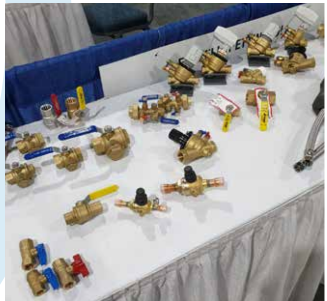
Still of Pettinaroli booth's display at RefriAméricas 2019