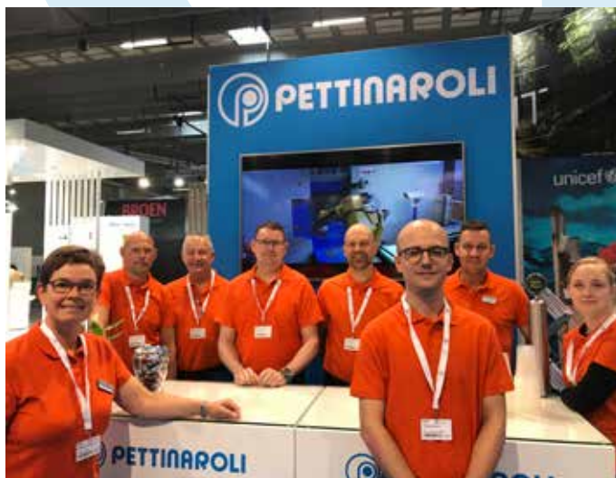
Pettinaroli A/S team managing the "Blue Stand" in Odense

V VS is the largest Scandinavian trade fair for water, heating, sanitary, ventilation and air conditioning. The edition held from May 8 th to 10 th 2019 has kept its reputation by confirming important numbers, 9.492 visitors with a record of 3.753 visitors on the second day of the fair. Among the 207 exhibitors this year, Pettinaroli A/S was one of the protagonists with the exhibition space located at stand C-4327. The attention of visitors was catalysed in particular by new products launched at the "Blue Stand" in Odense.