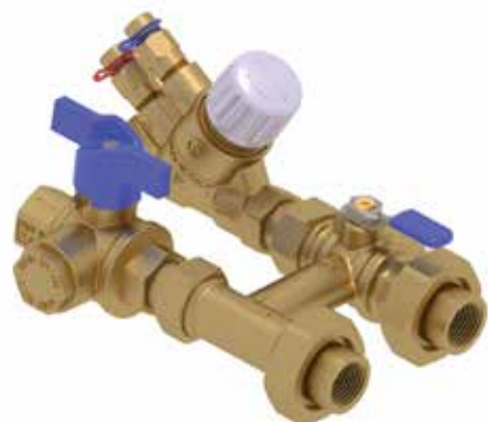
The XT702 preassembled kit

PCS give enormous advantages for any of the key roles involved in the drafting and making of a project