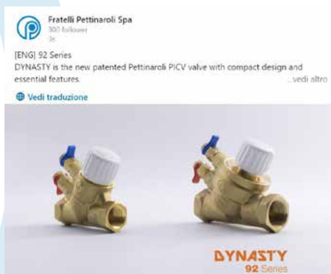
LinkedIn post on Dynasty Series 92 PICVs

Among the most peculiar innovations are the publication of live and 3D instructional videos as well as direct reports from the trade fairs and also insights on the Pettinaroli company processes and systems. Finally, the Pettinaroli Newsletter which, in addition to the usual highlighting topics of interest and providing relevant and targeted communications, has been