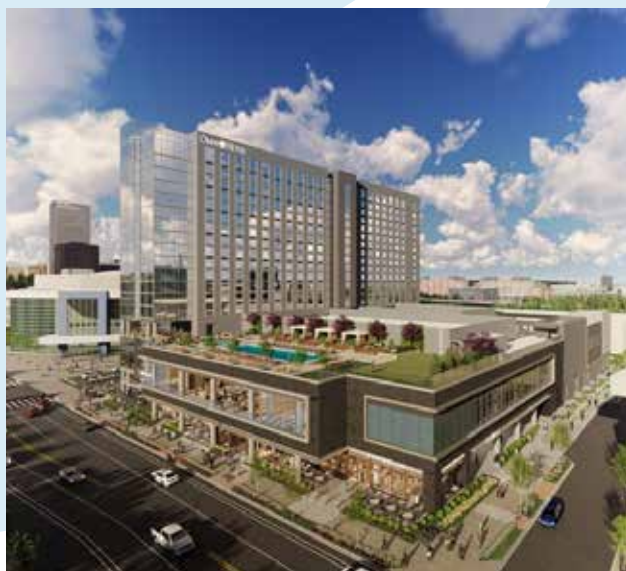
Render picture of Omni Hotel under construction in Oklahoma City