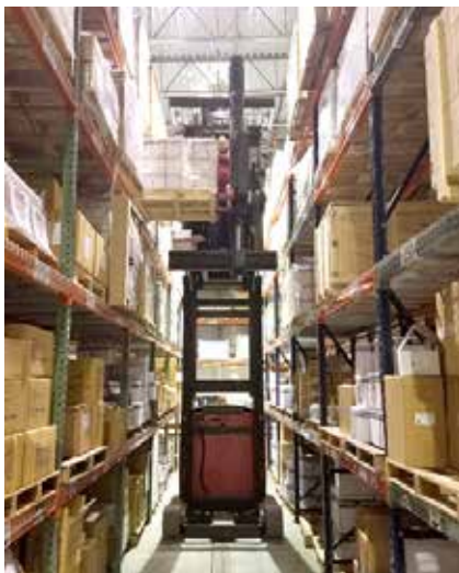
A forklift operating in Very Narrow Aisle warehouse

The 40.000 Ft 2 warehouse space has been reconfigured by narrowing the aisle and thus increasing the storage space by over 35% . This resulted in over 1.000 additional pallet locations allowing products to be stored in multiple ways and more efficiently, by giving them a location based on size. Of course this new warehouse layout significantly reduced the maneuvering space, from over 3m to 1.83m . That's why forklifts have been replaced with models conceived to allow Man-up picking so no more maneuvering space is now required.