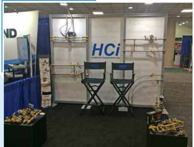
Hci exhibition stand at ASHE Show in Baltimore, July 14 - 17 2019