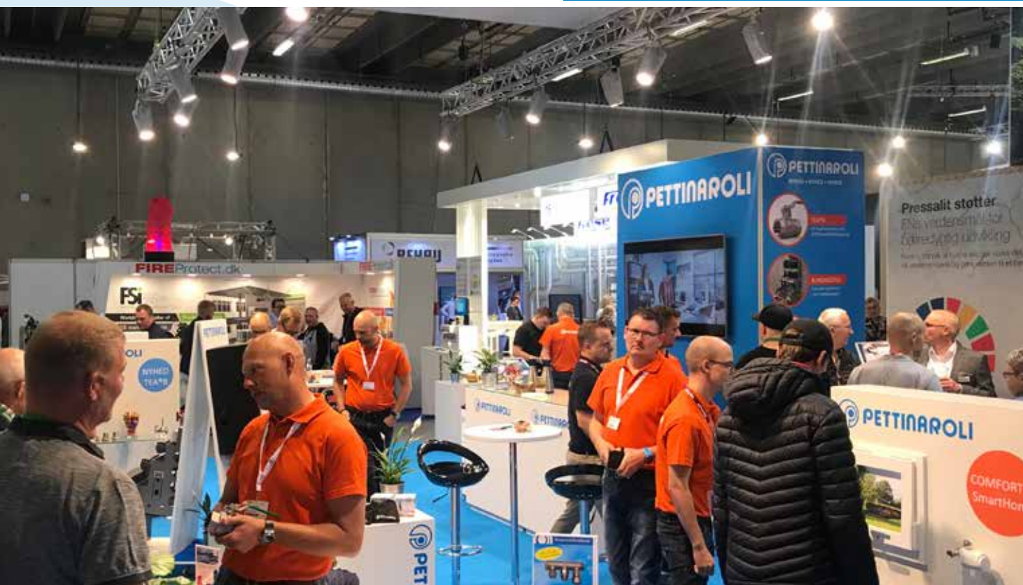
Still of the VVS's exhibition at Pettinaroli A/S booth

The new lower module for quick and easy installation of manifolds for underfloor heating, connection pipes for radiators and sanitary water, coming with a completely insulated supply tube (according to DS452), which guarantees minimum heat loss. The new ball valve, 51KE and 701CWB water meter connection with surface TEA ® B - "White Bronze" extremely resistant to corrosion and without nickel, lead or cobalt, therefore ecological for the environment and drinking water. The CC50 manifold with 2 or 3 ways for water distribution and last but not least, some news also in the control app for the IP Comfort system: with AlphaHome the user can control underfloor heating, light and other SmartHome functions in different homes. The IP Comfort system is also able to integrate with the voice commands of Google Home , making it possible to control most of the house devices directly with its own voice. Energy efficiency and ecology remain at the center of attention and, as demonstrated in the three days in Odense, Pettinaroli takes up this challenge by continuing to innovate to meet the new demands advanced by the market.