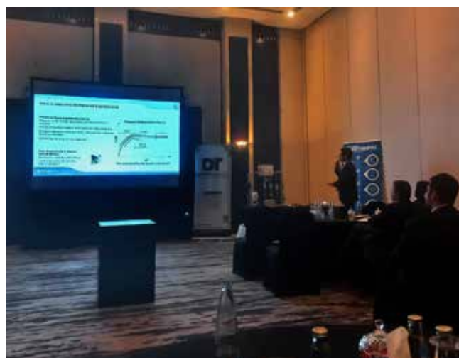
Upon: Marcello Passoni during the presentation. On top: Umesh Nair answering questions from the audience.

hot water recirculation circuits to ensure the required temperature in each section, preventing legionella formation and limiting heat loss.