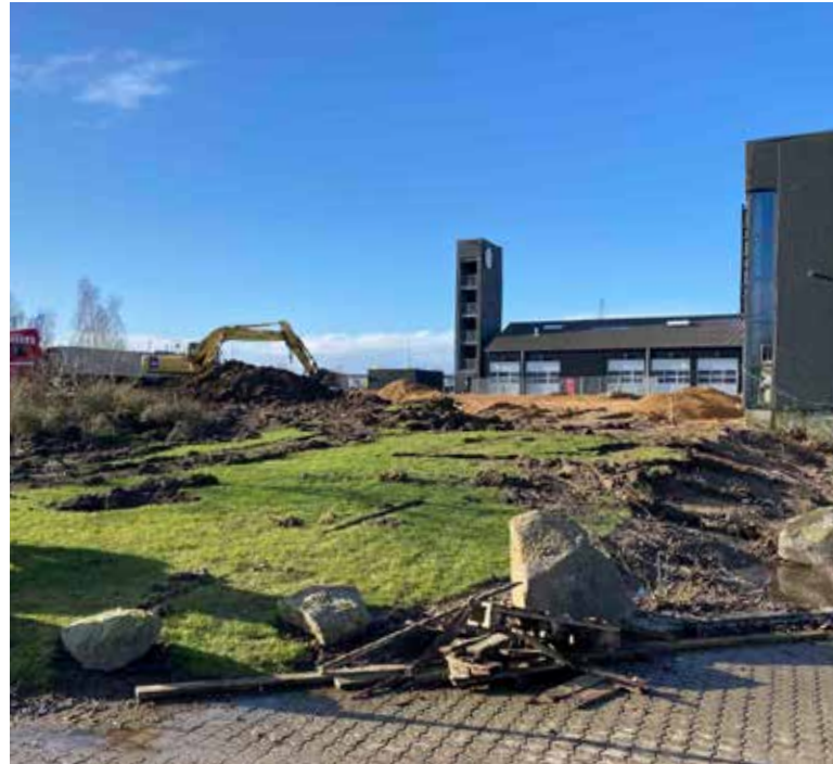
On top: Excavation work for the foundation laying. On bottom: The rendering of the new Danish warehouse.